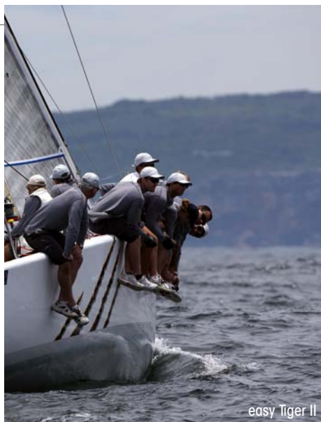
easy Tiger II